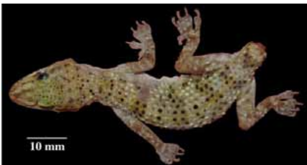
Figure 3. A specimen of H. persicus with autotomized tail from Shiraz, the capital of Fars Province.