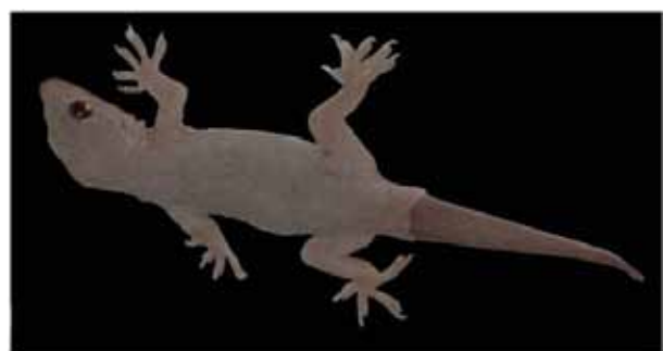
Figure 4. A new specimen of H. flaviviridis from southwest of Fars Province.