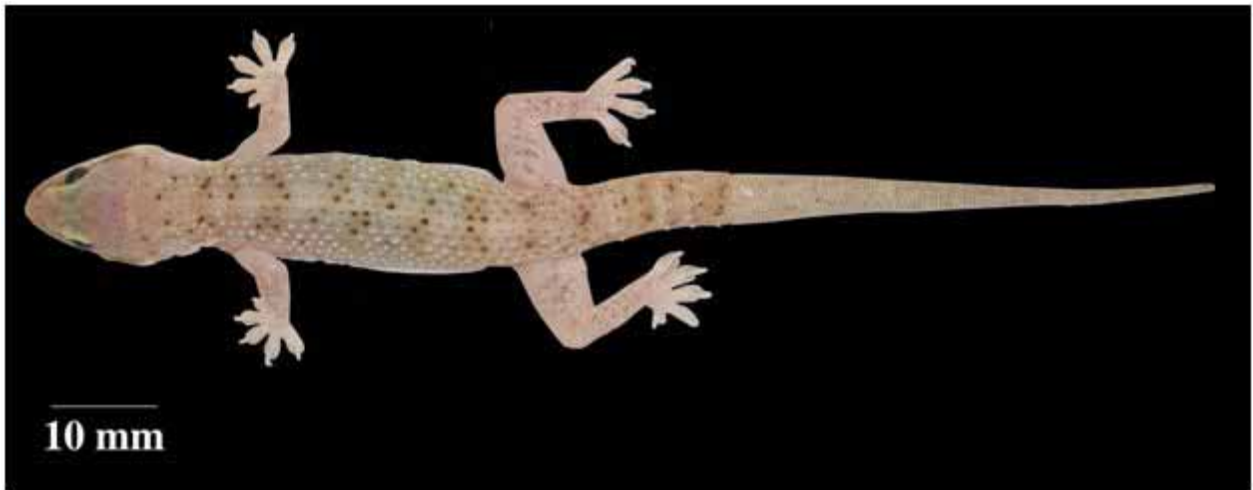
Figure 2. One of the three collected specimens of Hemidactylus turcicus from southwestern regions of Fars Province.